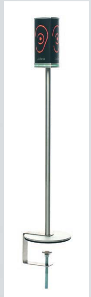
The Jabra Noise Guide comes with different attachment interfaces, to fit different office setups.